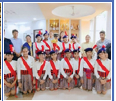
Bagpiper Band Girls Team of KIIT clinched the first position at the Zonal Athletics meet.