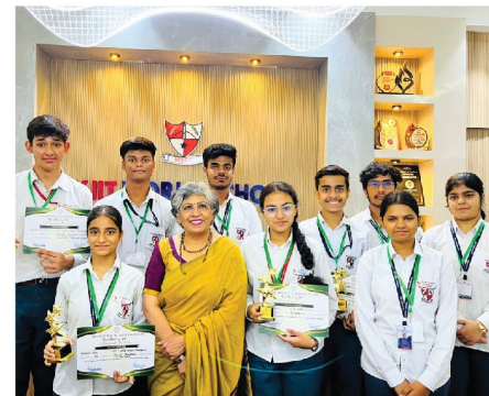
Our students shone at ComAstiva 2024 , organised by Delhi Public School, R.K. Puram, Delhi, bagging 1st Prize in Strategic Showdown & 2nd Prize in Quizonomics categories.